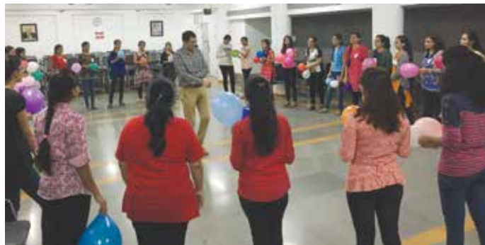
A workshop on Self Awareness