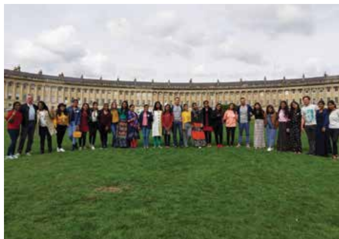
Royal Crescent- City of Bath

During our training program at ASHA Centre we were also taken to place where every student's wishes to go is to the Oxford City. We were considered as luckiest batch that not only had chance of visiting one of college ("Somerville College") from inside but also had an interaction with its Principal.