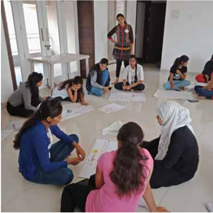
Pharmacy Lila Girls preparing the chart during the Four Temperament Workshop.