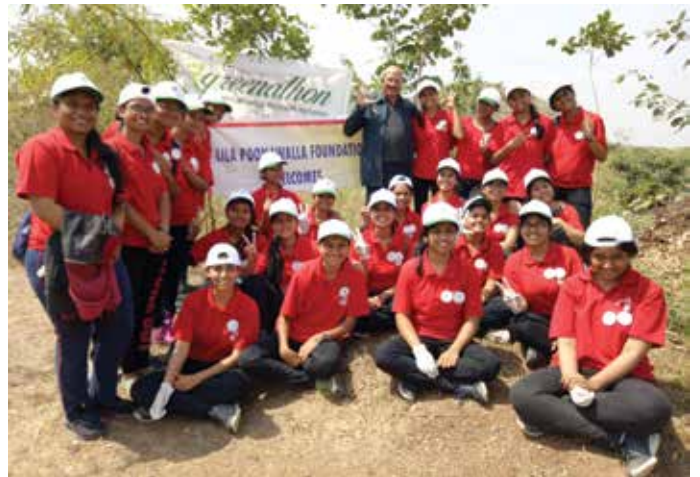
The Peace Ambassador 2018 batch did their first social activity 'cleanup drive and tree plantation' at Mahalunge hill