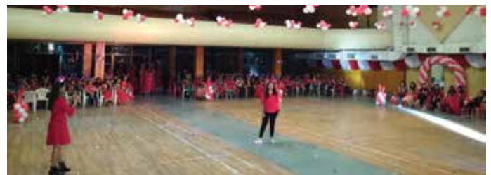
Ramp Walk by Lila Girls