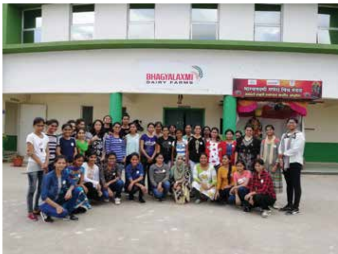
Visit to Gowardhan Dairy