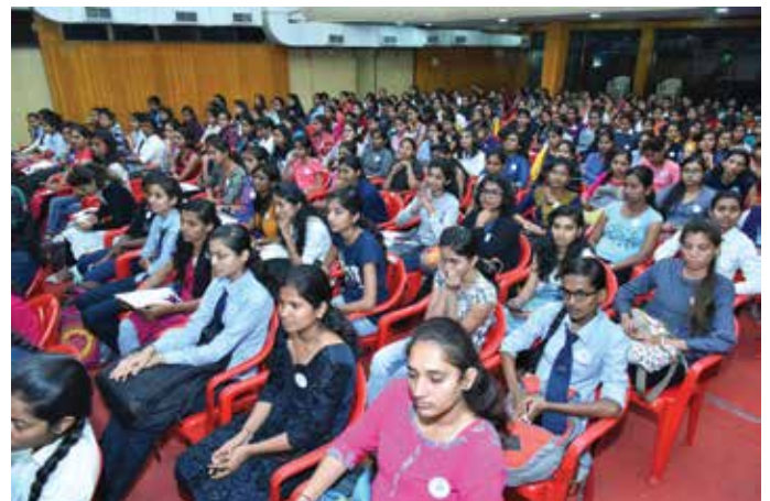
New Lila Fellows and Girls set to join the LPF Family