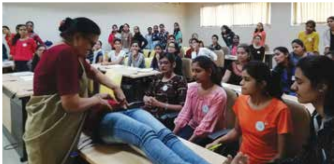
A workshop on Health Awareness