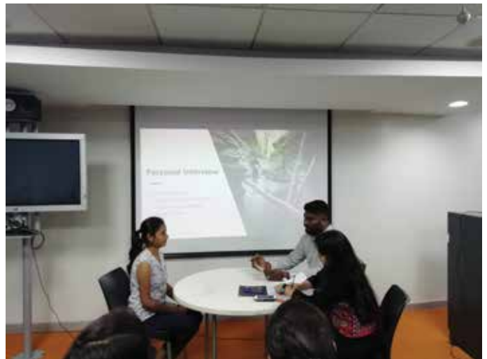
Personal Interview of last year Lila Girl being conducted by Amdocs HR department.