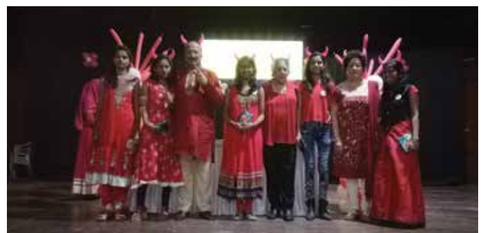
Prize distribution for game winners

party Senior Peace Ambassadors were also invited which added charm. The girls were dressed in their best outfits according to the theme. The party hall was beautifully decorated with balloons matching with the theme. The parties were followed by mouth relishing dinner and dessert. Everyone enjoyed the party with vibrant and latest music, sparkling lights, shimmering costumes and none the less, beautiful smiles. Was a rocking start of the New Year.