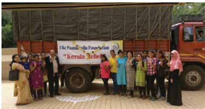
Truck departure to Sargakshetra, Kerala