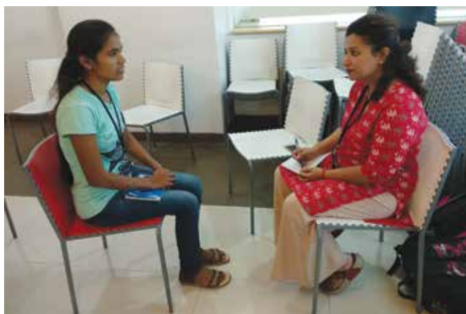
Success keys for cracking interview

This program was conducted for third year engineering girls; it was conducted by Barclays Team. The contents that were covered in the session were career orientation, English Communication skills, Resume Writing and interviewing skills in association with Barclays Technology Centre. The advantage of this program is that Lila Girls got to an opportunity to visit the company and experience