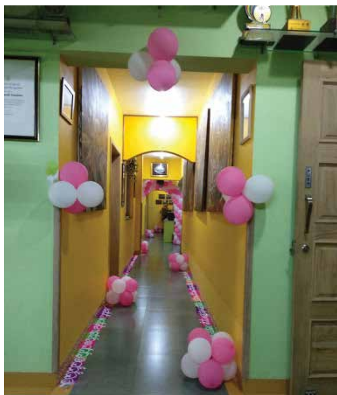
Birthday Decoration at LPF office

And what a celebration it was! Mom was truly surprised with the celebration that started at 9 in the morning and continued throughout the day. Mom's cabin was beautifully decorated with a number of balloons, ribbons and twinkling lights. The celebration began with Mom cutting the cake with Dad and the LPF Staff. All the Advisory board members, Trustees, Committee Members, well-wishers, school principals, Nursing College Principal, Relatives, Friends, and senior Lila Fellows, Lila Girls and Peace Ambassadors visited the LPF Office to wish Mom and showered her with their love and gifts. It was definitely a wonderful and memorable birthday for Mom.