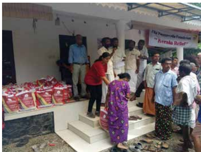
Distributing the Relief Kits to flood victims