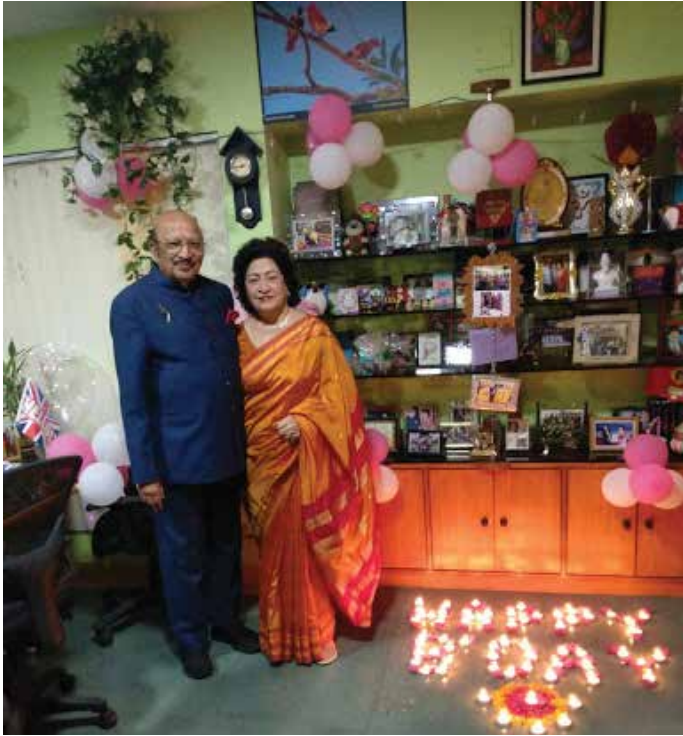
Made for each other - MOM & DAD