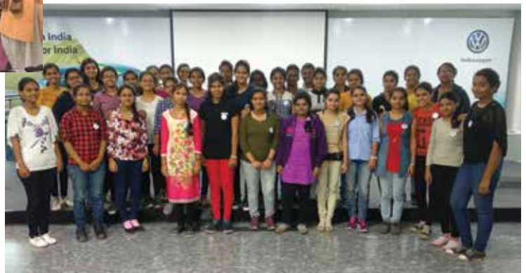
Industrial Visit to Volkswagen ▶