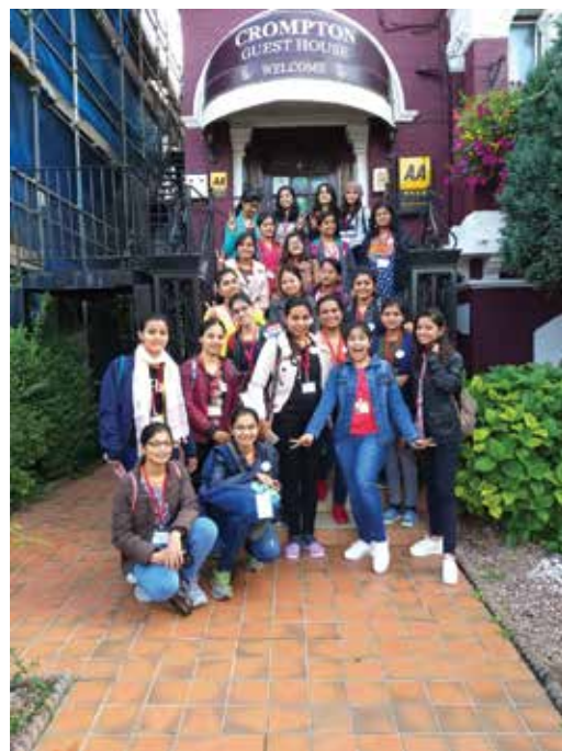
Crompton Guest House Stay at London

In this wholesome leadership training program, we had great opportunity to visit renowned places in central London such as a Magical London Eye, Historical Big Ben, Spectacular Tower of Bridge, Huge Tower of London and Royal Buckingham Palace. We also had chance of visiting historical British Museum, Parliament of London, Piccadilly Circus and Trafalgar square. Mom and DAD also took all of us at Sky Garden which was