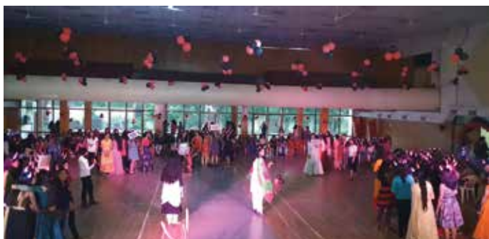
Lila Girls engrossed in playing the Bombing the City Game