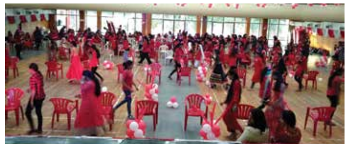
Lila Girls , Lila Fellows enjoying the musical chair game