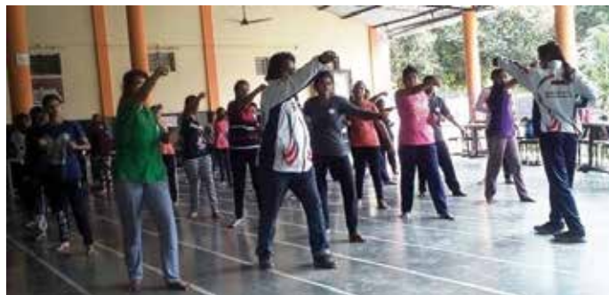
A Workshop on Self Defense