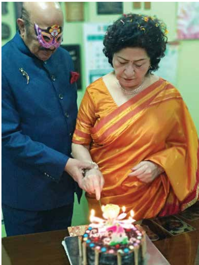
MOM & DAD cutting the cake

W hen someone near and dear to your heart turns another year older, you want to do everything you can to make their day a joyous and memorable one. Whether you're throwing a birthday party, a cocktail party or planning a dinner at the Honoree's favorite restaurant, it's a tradition to give the Guest of Honor a Happy Birthday card. And the smile that spreads on their face is the only return gift we need.