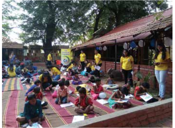
Celebration of Children's Day with Punarutthan Samarasta Gurukulam by Peace Ambassadors 2017 batch.