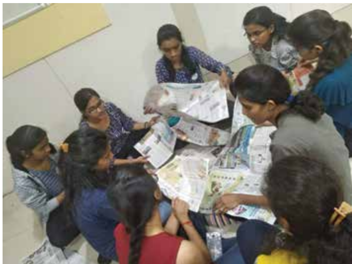
Group Activity of paper cutting to prepare a story out of it.