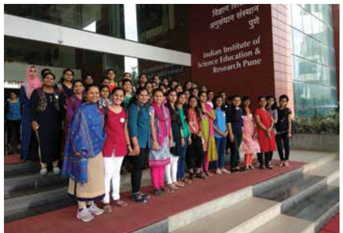
Group Photo at Indian Institute of Science Education & Research Pune