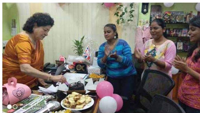
Birthday celebration by Lila Fellows and Lila Girls at LPF office

For the rest of the world 16 th September is just another day. But for the Lila Poonawalla Foundation family, it is the birthday of our beloved Mom. In 2018, Mom completed 74 years of an adventurous life and embarked on the journey of the 75 th year. Having celebrated Mom's birthday every year in a traditional manner, our sweet and loving Dad decided to throw a surprise birthday party for Mom. The celebration was planned on 19 th September, 2018 because on 16 th September, 2018 Mom was at London Asha Center and was coming back with the Peace Ambassador batch 2018. Dad invited everyone to come and celebrate Mom's birthday at the LPF Office.