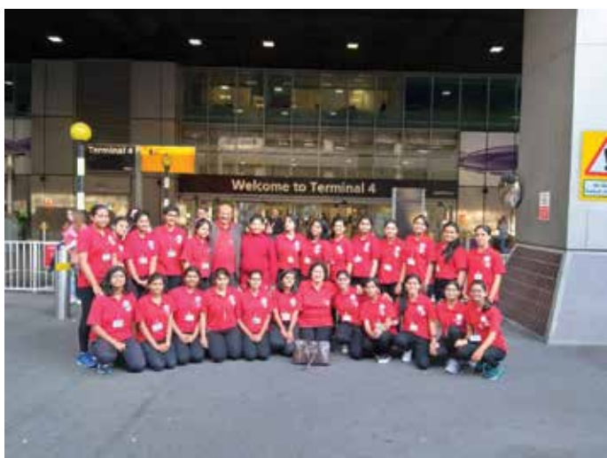
Peace Ambassadors landed at Terminal 4, Heathrow Airport

And that is when we all 24 realized that our dream of traveling to United Kingdom, Asha Centre and to learn enormous new things have come true. The day of interview; tension, anxiety and still being confident was a mixed game of emotions! Until one day we 24 sisters got a mail of selection for the Peace Ambassador program and yes, everyone must have shouted their hearts out: WE DID IT!