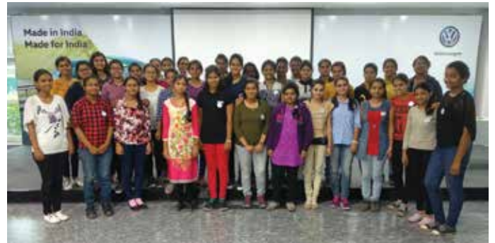
Industrial Visit at Volkswagen

I learnt and saw a lot of new things related to cars and manufacturing which I had seen before only on