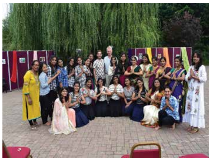
Indian Tea Party

Indian tea party was beautiful program arranged by peace ambassadors and purpose was to showcase Indian culture through art, attire and cuisines. It was a perfect example of what ASHA Center believes in, that is intercultural exchange. This party was attended by all the volunteers of ASHA Centre and people