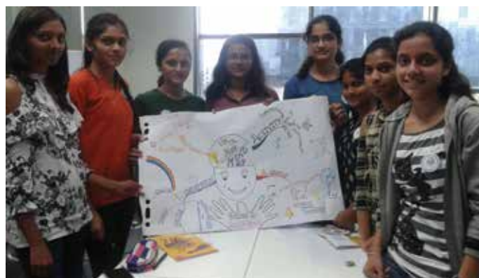
Mind Map prepared by Lila Girls