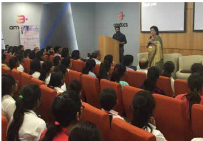
Lila mom addressing Lila Girls at a workshop organized by Amdocs