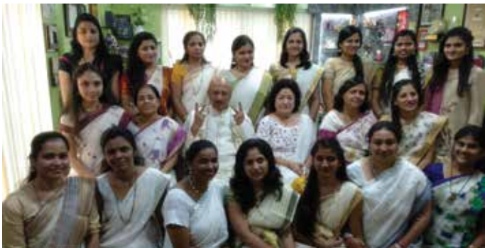
Navaratri Celebration of LPF Staff with Mom & Dad