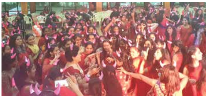
MOM enjoying dancing with Lila Girls, Lila Fellows