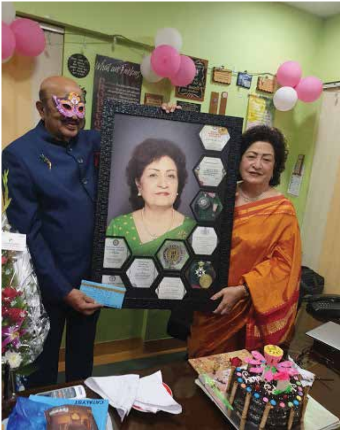
A frame of MOM's photo- gift to MOM by LPF staff