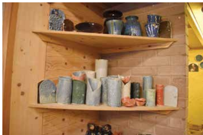
Pottery - Grange Village

Grange village which is a symbol of equality, positivity, acceptability and happiness. The people in Grange were special people but their enthusiasm and excitement to learn new things and to live their lives full fledged gives us motivation and inspiration. Pottery, gardening, cooking wood workshop, bakery and basketry provide day opportunities for them.