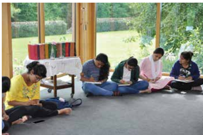
PAs Taking down note- Session on Mahabharata