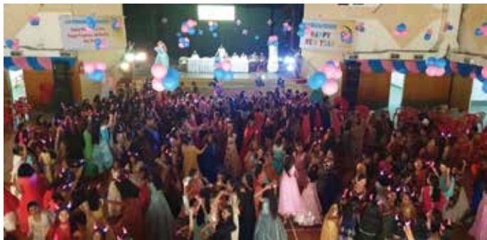
Lila Juniors enjoying dance in the New Year Party 2019

The Lila Poonawalla foundation continues its gleaming journey with all stars doing well in their lives. The new beginning of the year starts with the grand parties for all the girls in the family. The party had vivid themes and all the girls from different fields enjoyed the gathering with beloved Mom and Dad. The parties were conducted on 3 rd , 5 th , 8 th and 9 th January 2019. Each day had a different theme and girls were dressed accordingly. The party was conducted for the new batch of Lila juniors, Lila Girls, Lila Fellows from PG, Science, Pharmacy, engineering and Nursing sections. All the parties had a batch of new girls with Senior Lila fellows and Peace Ambassadors from the earlier batches of 1996 – 2010. The parties had different games like musical chair, Bomb in the city followed by Ramp walk which was filled with lots of fun and enthusiasm. The games had exciting prizes which were given at the hands of Mom and Dad. Also there was dance with vibrant music in the air. When it comes to dancing; no one can compete Mom - Dad and their energy is unparalleled. In each