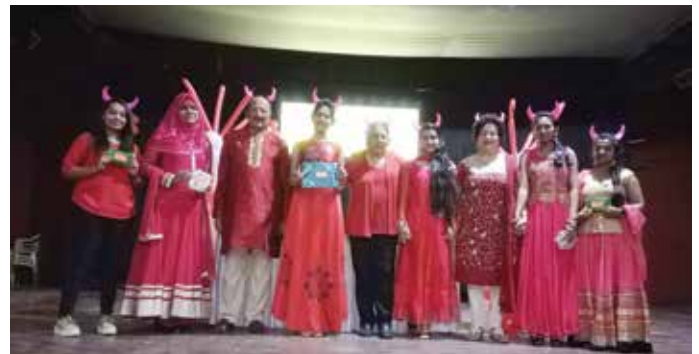
Mom and Dad with participants