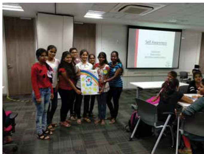
Lila Girls presented their presentation at Self Awareness Training Program